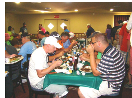
Lunch at the Turn, Dinner at end of the Scramble, Entry into Door Prize Drawing