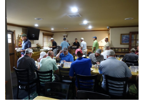
Lunch at the Turn and Dinner at the end of the Scramble