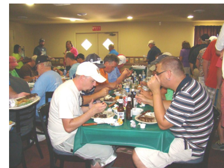
LUNCH at the Turn DINNER at the end of the Scramble ENTRY into our Door Prize Drawing